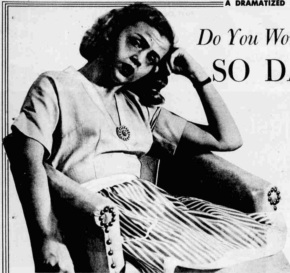
Posed by professional model

A DRAMATIZED STORY THAT COULD HAPPEN TO YOU!