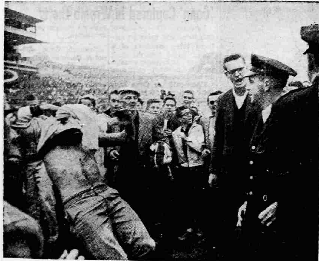
"SAVAGE" ESCAPES—The over-enthusiastic football fan at left almost pulled out of his shirt, but he escaped from police during the near-riot following the 49ers-Colts football game at Kezar Stadium in San Francisco. The riot ensued when police tried to prevent the tearing down of the goal-posts after a 21 to 12 victory by the home-town team. Police described the rioters as "like savages."