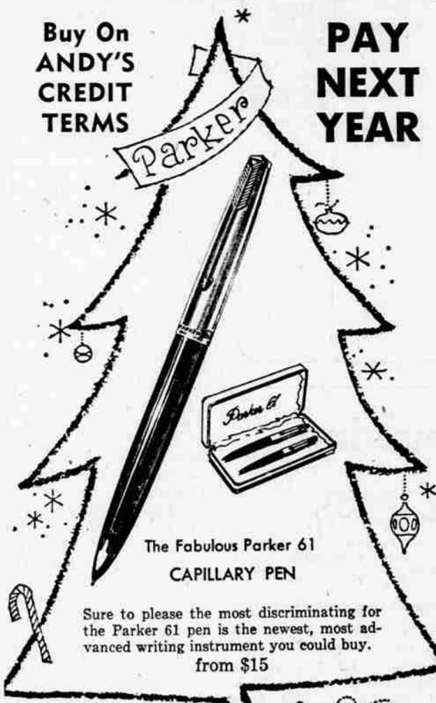
The Fabulous Parker 61 CAPILLARY PEN

Sure to please the most discriminating for the Parker 61 pen is the newest, most advanced writing instrument you could buy. from $15