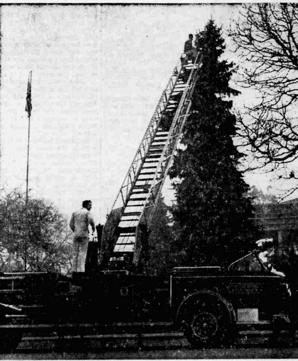
LONG REACH —The Medford fire department's 85-foot aerial ladder rig has proved itself to be a "handy gadget" to have around for a number of things besides fighting fires, and use was made of it yesterday when strings of Christmas lights were hung on the two blue spruce trees in front of the Medford library. The trees are so tall and the

Brownlee, Idaho - (UPI) - Idaho Power's third 90,000-kilowatt generating unit at Brownlee dam across the Snake river went on the line today.