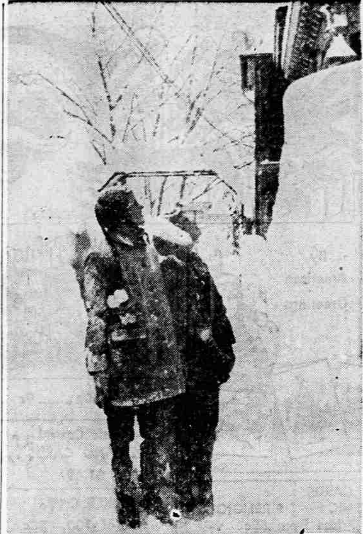
HEAVY SNOWFALL —Oswego, N. Y., has been nearly paralyzed by a four-foot fall of snow, which piled up drifts as deep as 20 feet. These two girls find themselves in a regular canyon of snow bounding this shoveled walk.