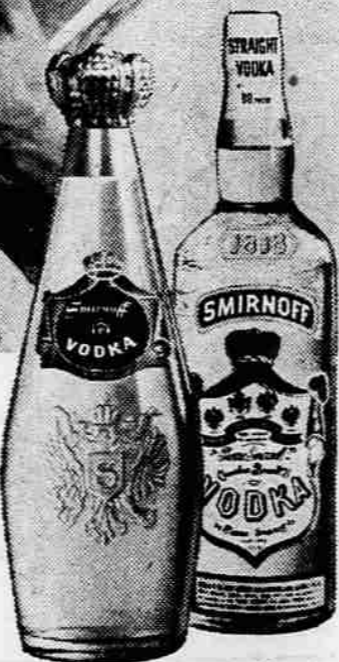
Gift Wrapped Decanter or Regular Bottle

80 AND 100 PROOF. DISTILLED FROM GRAIN. STE. PIERRE SMIRNOFF FLS. (DIVISION OF HEUBLEIN), HARTFORD, CONN.