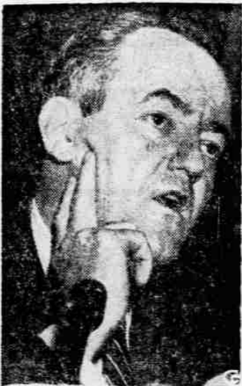
RETURNING TO Washington from Moscow visit, Senator Hubert Humphrey (D-Minn.) gives confidential message to President Eisenhower from Soviet Premier Khrushchev.