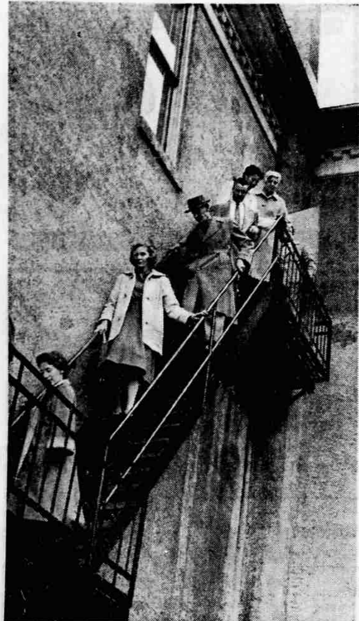
FIRE ESCAPE —A group of parents and civic leaders in Ashland were taken on a tour of the Ashland Junior High school this week, so they could see for themselves the fire dangers that exist in the building. Part of the group, above, is shown coming down the narrow fire escape that would be used by students in evacuating the building.