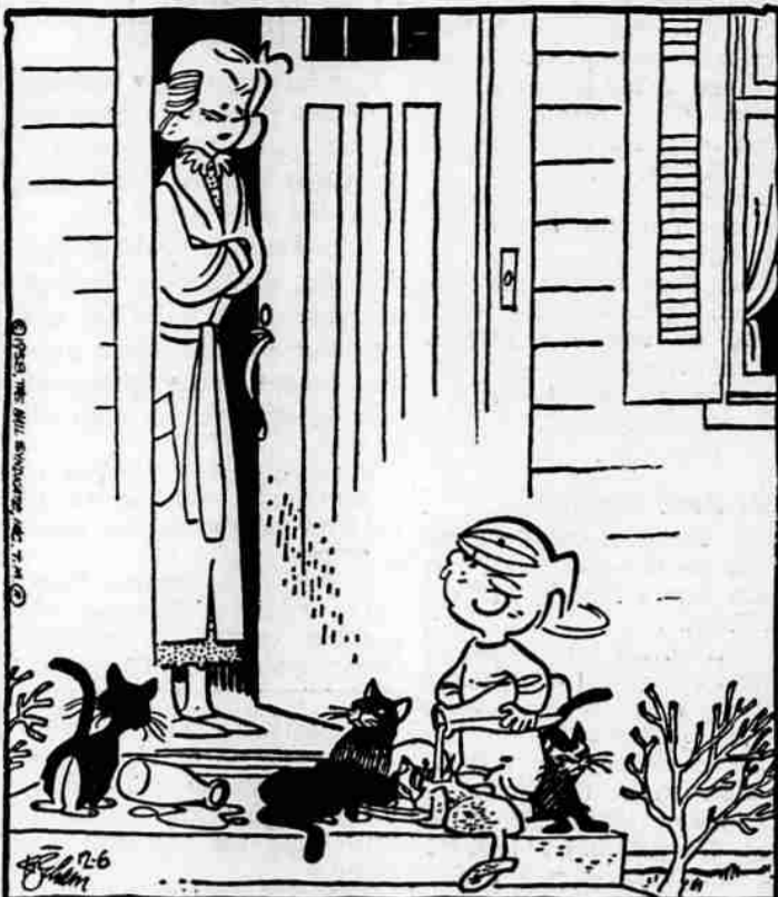
"WELL, H, MOM! CARE FOR A GLASS OF MILK?"