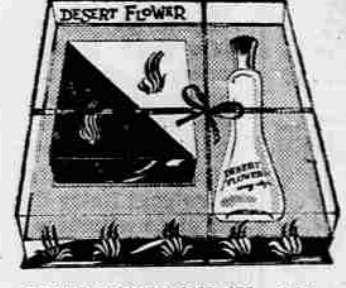
DESERT FLOWER GIFT SET 4.50 Dusting Powder and Spray Cologne beautifully gift-packaged in gold, green and white.