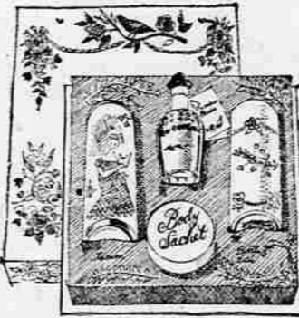
FRIENDSHIP'S GARDEN "Charm" Set 1.25 Guest sizes of Toilet Water, Bubbling Bath Crystals, Talcum, Body Sochet.

Your gifts by SHULTON give special Christmas pleasure