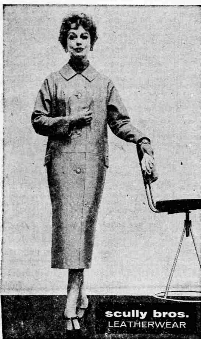
scully bros. LEATHERWEAR