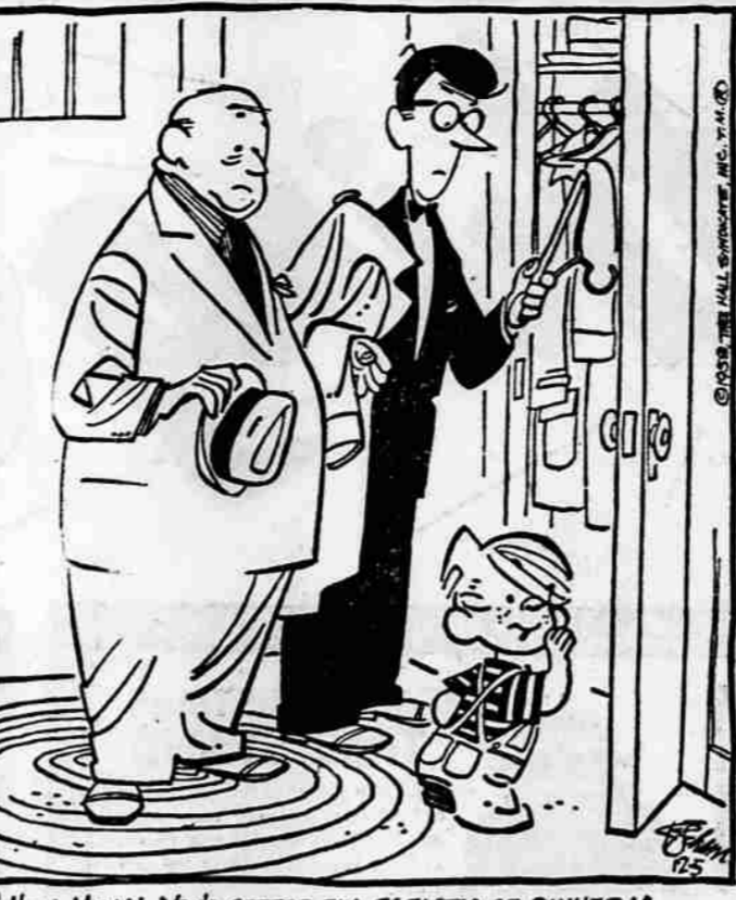
"HEY, MOM! YOU'D BETTER FIX PLENTY OF DINNER!"