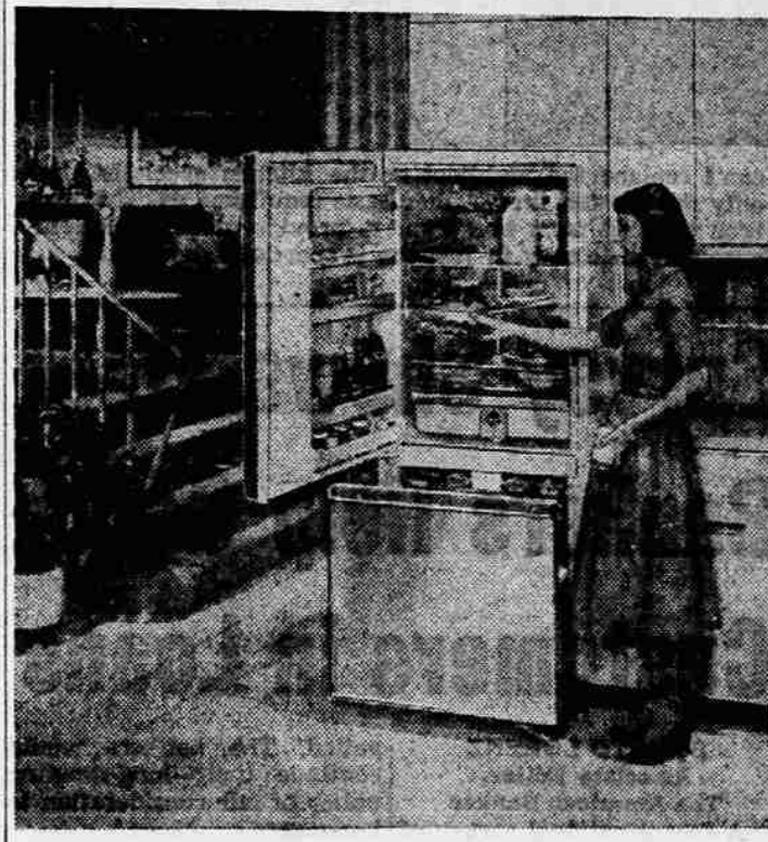
AUTOMATIC DEFROSTING AND NON-FROST REFRIGERATORS make possible a whole new concept in kitchen planning. When she no longer has to stagger back and forth with dripping trays, the housewife can more closely integrate her other living areas.

So, for the job she likes best, help your wife be her creative best by giving her the best tools available. In cooking, that means a modern electric range.