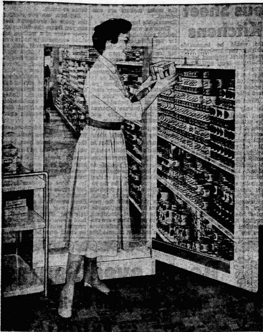
JUST LIKE A SUPERMARKET IN HER HOME - Modern electric freezers give today's homemaker undreamed of convenience and flexibility in meal preparation. Among the freezer's advantages are fewer shopping trips, and the opportunity to pre-

pare dishes - and even whole meals - days or weeks in advance. In addition there are real savings opportunities when you buy seasonally-plentiful lower-cost foods and in large quantity purchases.