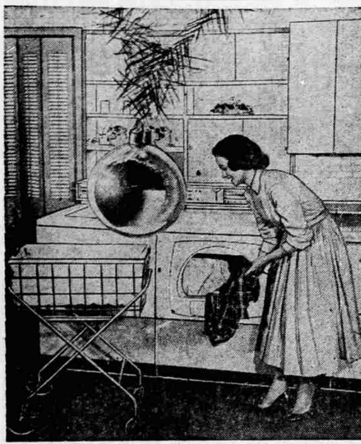
WASHING IS FUN - As she easily transfers the clothes from washer to dryer, your wife will always remember the long steps up from the basement to the backyard, and the hanging of the heavy clothes on dreary days. Every washday, she'll thank you for her White Christmas.

Adjustment of water temperature for personal use or for a variety of household chores is as simple as a twist of the dial on your automatic gas water heater.