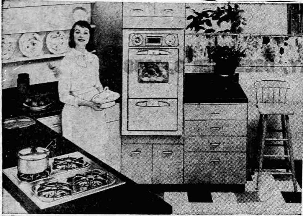
GAS KITCHEN - The whole family makes itself at home in today's attractive, well-organized gas kitchens. With versatile utility the keynote, the kitchen is part of the family living area, as well as the center of Mom's homemaking projects. And efficient gas appliances, from ranges to water heaters, are handsomely designed to make themselves at home with any kitchen decor.