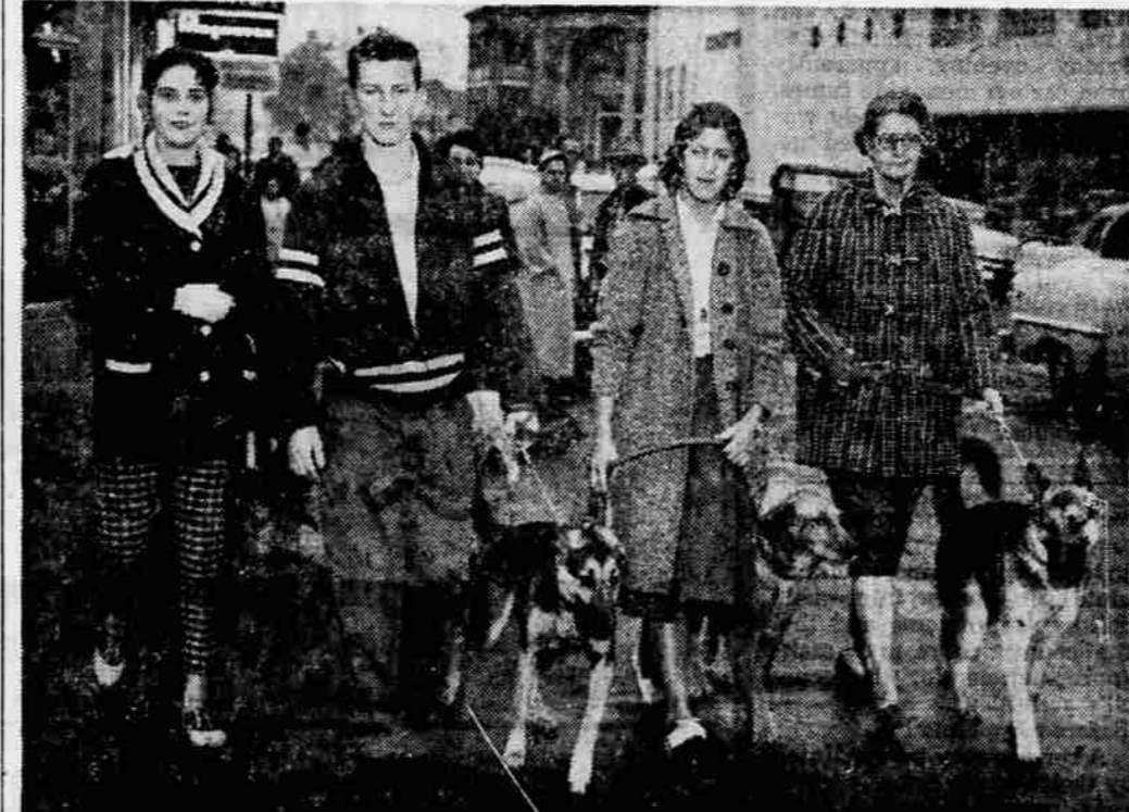
GUIDE DOGS —Members of the Siskiyou Guide Dog 4-H club attracted a lot of attention last week when they brought their animals into downtown Medford to familiarize the dogs with traffic, strange people and elevators and stairways. The club is the only one of its kind in the state of Oregon and has been functioning for about a year. Members keep the dogs in their homes for a period of nine months before sending them to the San Rafael Blind Dog

New York—UPI—Charles (Old Hoss) Radbourne, famous "iron man" pitcher of the pre-1900's, hit a home run in the 18th inning on Aug. 17, 1882, to win a 1-0 decision.