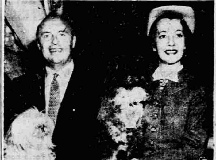
ENDING MARRIAGE of 22 years, Lily Pons, noted coloratura soprano, obtains divorce in Juarez, Mexico, from Andre Kostelanetz, orchestra conductor, charging incompatibility. Picture of couple with dogs was made in 1950.