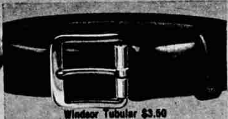
Windsor Tubular $3.50