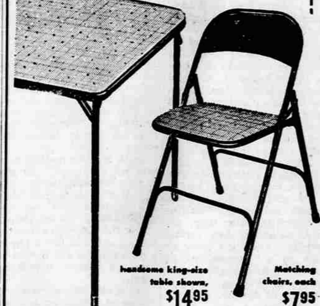
handsome king-size table shown, $14.95 Matching chairs, each $7.95

GIVE THEM PERFECT GIFTS FOR: anniversaries, mothers, young marrieds, birthdays, any occasion