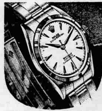
(6567) Stainless steel case with 14 kt. fluted bezel, 25 jewel chronometer movement... $200.00 I.I.I., bracelet extra.