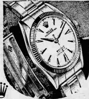
(6565) Stainless steel case with 14 kt. gold bezel and crown, engine turned bezel, 25 jewel chronometer movement... $185.00 I.I.I., bracelet extra.