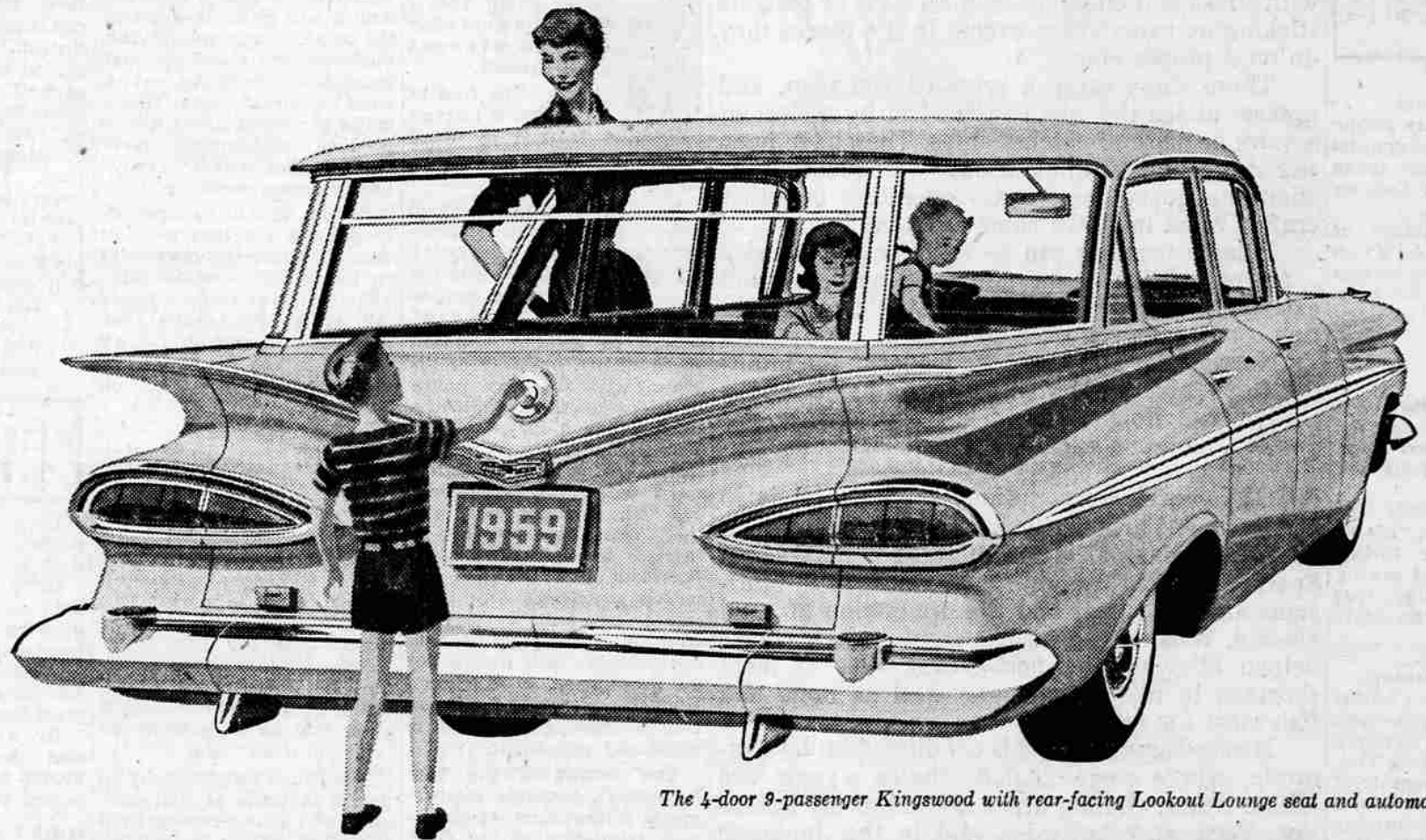
The 4-door 9-passenger Kingswood with rear-facing Lookout Lounge seat and automatic rear window

TOP ENTERTAINMENT—The Dinah Shore Chevy Show—Sunday—NBC-TV and the Pat Boone Chevy Showroom—weekly on ABC-TV.