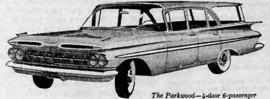
The Parkwood—4-door 6-passenger