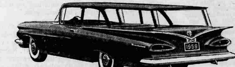
The Brookwood—2-door 6-passenger

now—see the wider selection of models at your local authorized Chevrolet dealer's!