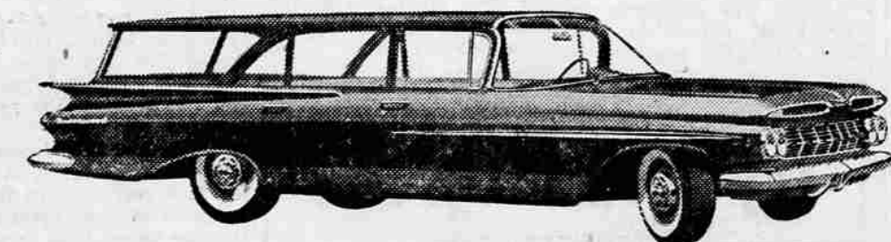
The Brookwood—4-door 6-passenger

what America wants, America gets in a Chevy!