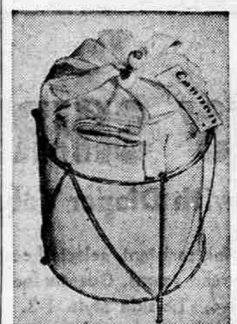
GIFT SET — Entirely new is this towel gift set "Basket Planter," with its contents daintily tucked inside a brass flower planter that has an inside metal container. Two of each: bath towels, finger-tip towels and wash cloths.

A variety of rigid bracelets, classic or stone-set, carry out the feeling of the trapeze. Stone-set bracelets lend important color to costumes. Wide cuff bracelets are fashion musts for suits and tailored dresses. Slender bangles, and delicate flexible beauties are meant to be worn several at a time for bulk and impact! Fashion decrees that bracelets should be worn in pairs on both wrists for a chic, balanced look — so wrap up bracelet gifts in "pairs" for Christmas!