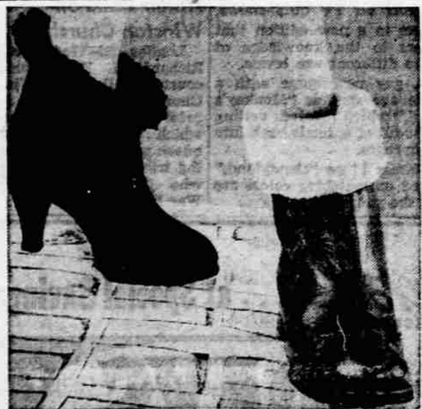
HIGH FASHION —Two for the road in leather in high fashion boots that boast the new fur look! Shown here is a luxurious black suede with Persian lamb trim, and a welted stadium boot with wide cuddly shearing cuff and lining. Either pair will make a wonderful gift!