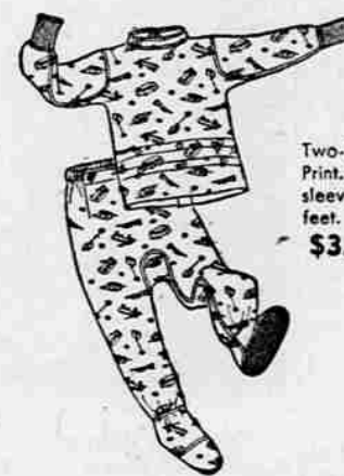
Two-Piece Sleeper. Little Toys Print. Snap-fastened, Nevabind sleeves, Gro-Feature, Safety-Step feet. Blue or red. 6 mos.-4 yrs. $3.00

A luxurious fabric—wonderful to touch, toasty-warm to wear—sweetly striped. Lots of those fine Carter features here too— "Safety-Step" plasticized non-skid feet, two-piece, snap-fastened, Gro-Feature and Nevabind sleeves. All this and machine washable too! Never needs ironing. Carter-Set—so won't shrink out of fit. Aqua, blue, pink or red stripes. 6 mos.-4 yrs. $3.00