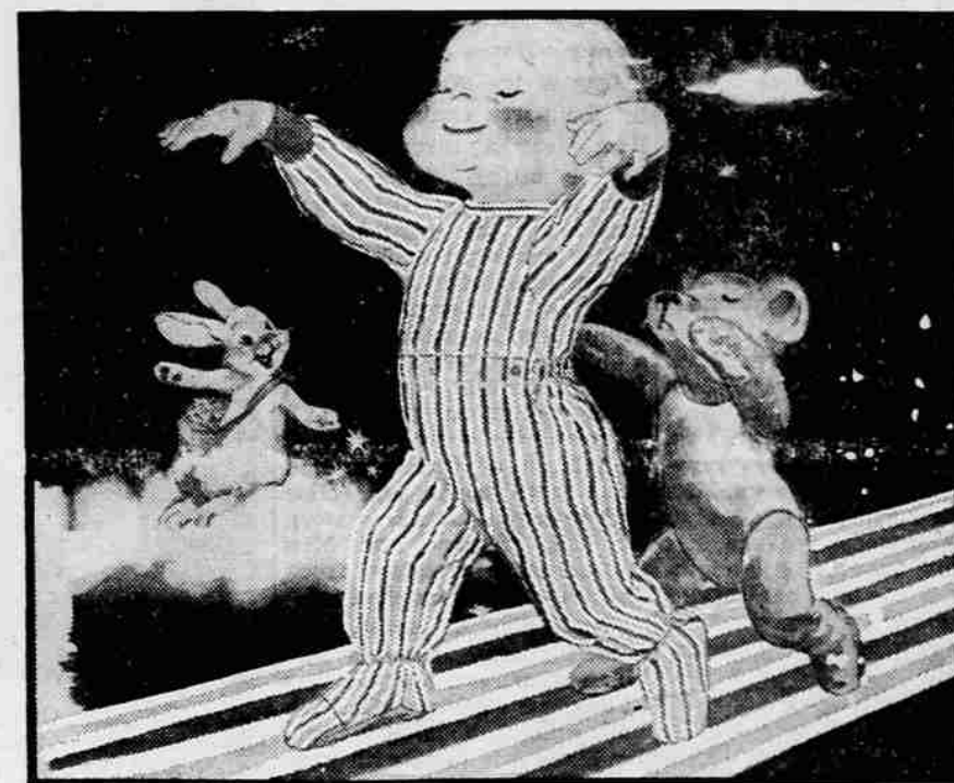
Dreamland Is Just a "Safety-Step" Away

The folder describes 20 different interior applications for the translucent panels, including room dividers, shoji screens, luminous ceilings, tub enclosures and shower doors, work surfaces, cabinet doors and indirect lighting fixtures. Available upon request from the Filon Plastics Corp., Consumer Service Dept., 125 Lomita St., El Segundo, Calif.