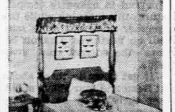
Everything nice to match what "little girls are made of" is found in this colonial bedroom for your daughter. Furniture is solid maple in a warm brown finish.