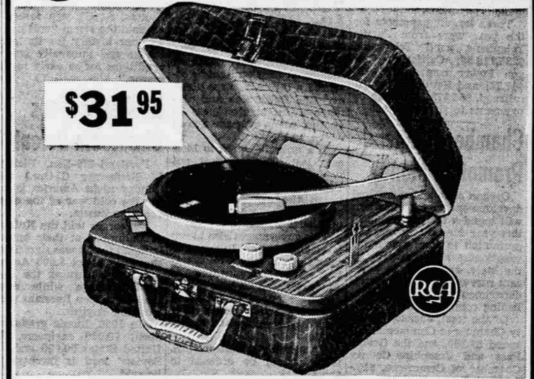
LIGHTWEIGHT metal turret-topped case covered with washable vinyl. Won't scratch, peel or crack. Antique white, or tropic brown alligator, sky blue or saddle morocco. Model 1EM2.