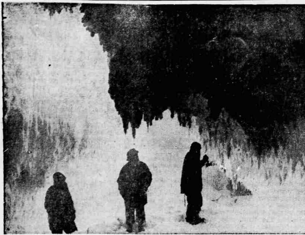
ICE CAVERN AT SOUTH POLE —Silhouetted against the glare of a hidden floodlight, three members of a U.S. Navy task force explore ice formations in an Antarctic cave filled with stalactite-like icicles. These men were part of a wintering-over unit which remained in the Antarctic throughout the long winter night in support of the International Geophysical Year program.