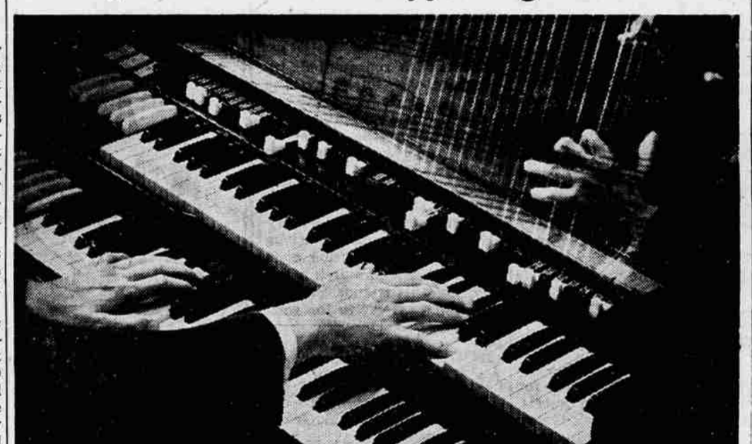
Tones similar to orchestra bells, chimes, marimba, harp, and others.