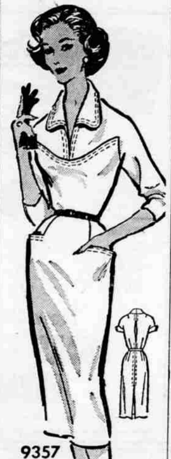
9357 12-20; 40, 42 by Marian Martin

Day-after-day dress—casual yet cut with distinction to give you a slim, trim figure. Note filpover collar, curving yoke, hip pockets. Choice of two sleeve versions. Tomorrow's pattern: Misses' sheath. Printed pattern 9357; misses' sizes 12, 14, 16, 18, 20; 40.