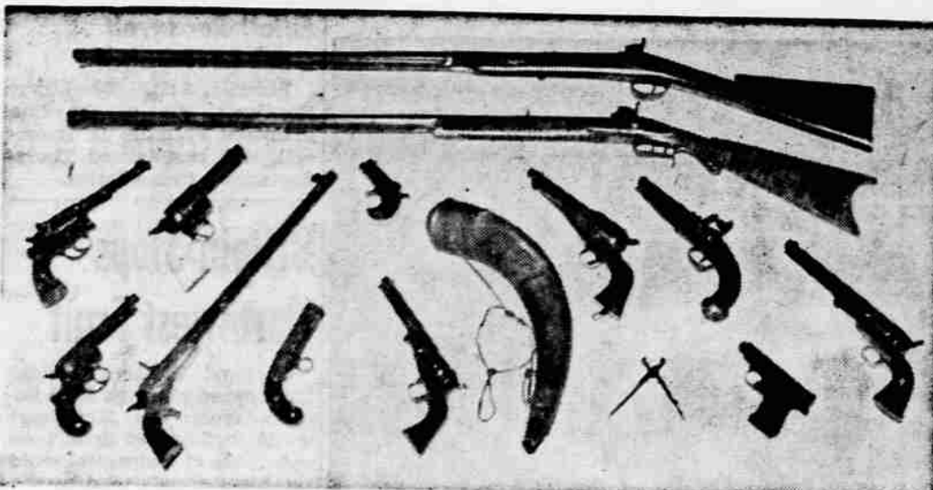
AT CHIN UP SHOW —Shown above is a portion of an antique gun collection, owned by Kenneth McHugh, 500 North Berkeley Way, which is on display at the Chin Up club. The show, which also features a sale

Day-after-day dress—casual yet cut with distinction to give you a slim, trim figure. Note filpover collar, curving yoke, hip pockets. Choice of two sleeve versions. Tomorrow's pattern: Misses' sheath. Printed pattern 9357; misses' sizes 12, 14, 16, 18, 20; 40.