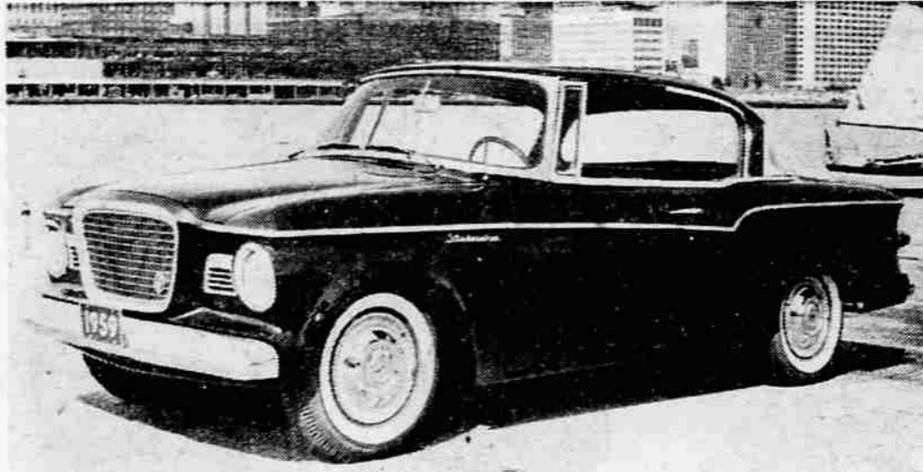
NEW LARK—Studebaker's new 1959 Lark goes on display at De Leigh Motors, 134 South Riverside ave., Medford, Friday. The Lark hardtop, which comes in the Regal and trim version with a six or V-8 engine, is shown above. The two-door sedan is offered only with a six-cylinder engine and in Deluxe trim, while the station wagon and four-door sedan are available in both Regal and Deluxe and six and V-8 engines.