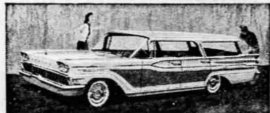
MERCURY'S COUNTRY CRUISERS...Unique hardtop styling. Retractable rear window. Fold-away 3rd seat that faces front. Concealed package compartment.