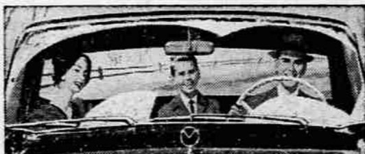
MERCURY'S FIRST WITH SIDE-TO-SIDE WIPERS...They clear a 42% larger area...a 5-foot swath...including the center section. Only Mercury has this aid to safer driving.