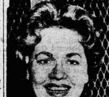
CALLAS REPLACEMENT—Viennese soprano Lionie Rysanek, appearing in Los Angeles with the San Francisco Opera Company, is all smiles after being engaged by the New York Metropolitan Opera Company to replace Maria Callas. It was announced Miss Callas was fired for refusal to live up to the terms of her contract.