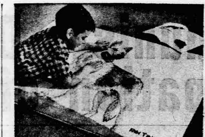
BOY'S BEST FRIEND —To the delight of young fans of the famous TV star, Karastan has woven the likeness of Rint Tin Tin in this washable cotton rug. And it will delight Dad, too, who remembers Rinty as the madcap movie idol of his youth. This rug is one of many this fall featuring animal motifs for children's rooms.

1:30 p.m.—Rogue Valley Hospital auxiliary, board and staff room.