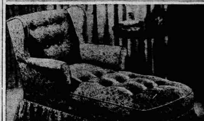
If you translate chaise lounge from the French, you get "long chair," and that's an exact description of the way this piece of furniture started. Beds were so ornate and large during the early reign of Louis XIV that the chaise was designed for daytime rest. In time the chaise lounge, too, became elaborate, often involving three luxuriously upholstered pieces (two arm chairs joined by a stool). This style in colonial America was simple (upper), came with loose cushions thrown on top. Below is a model introduced this fall by the Cox Manufacturing company, Inc.