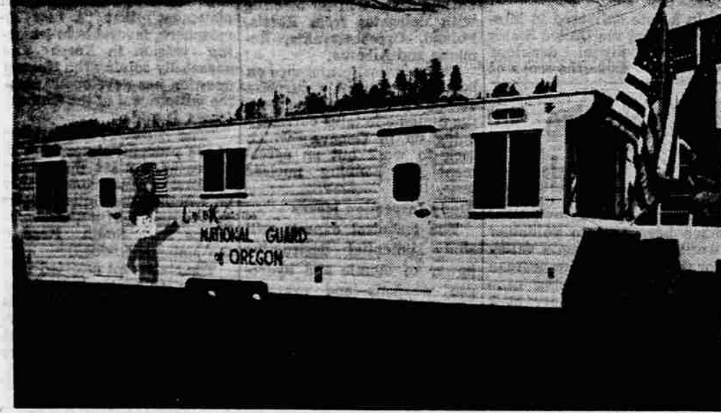
ON DISPLAY HERE —The Oregon National Guard display trailer, unique in the nation, will arrive in Medford to participate in this year's Veterans Day celebration Tuesday. The 35-foot trailer features a large scale model of the 41st Infantry Division's landing on the beaches of Zamboanga in the Phillipine Islands in 1945. Modern military equipment also will be shown. The exhibit has won nationwide recognition and imitation since it premiered this spring. The trailer will be on display at the First National Bank of Oregon, Medford branch, all day Tuesday.

The first Swedish settlement in America was made in 1638 on the lower Delaware river where the city of Wilmington is situated. Although no woman on record has ever visited the Antarctic, many of the regions around the South Pole are named for women.