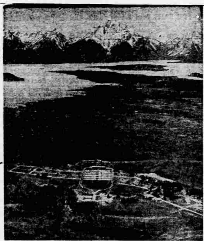
Jagged spires of Grand Tetons form western boundary for spectacular Jackson Hole country in Wyoming. In foreground is $6,000,000 Jackson Lake Lodge.

Out of this interest in conservation on the part of the elder Rockefeller came a unique nonprofit organization, the Jackson Hole Preserve, Inc., which he founded and financed in 1940 and whose work is being carried on today through gifts from him, from the Rockefeller Brothers Fund and from his son, Laurance, who is president of the Jackson Hole Preserve, Inc.