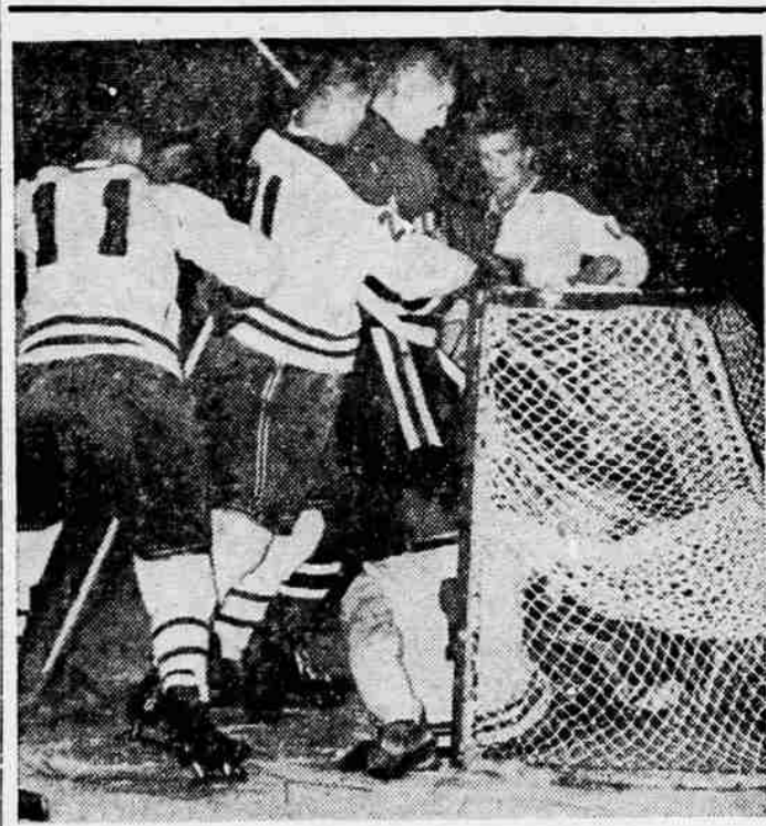
NET TANGLE —Montreal Canadiens pile up at their own net as Black Hawks' Eric Nestehenko (dark sweater) attempts to score through sheer determination during the second period of the Black Hawks-Canadiens game in Chicago. Canadiens' goalie Jacques Plante, sitting down in the net, made the save. Game was a tie, 5 to 5.