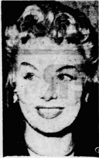
RECOVERING from overdose of sleeping pills in Las Vegas, Nev., is Lili St. Cyr, noted strip dancer.