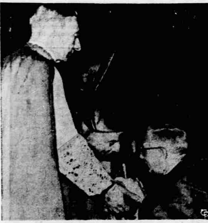
KNEELING BEFORE POPE JOHN XXIII , James Cardinal McIntyre, Los Angeles, renders homage to new occupant of throne of St. Peter in Sistine Chapel, Vatican City.