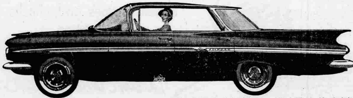
Now there's an Impala Sport Sedan... one of Chevy's full series of Impalas for '59.