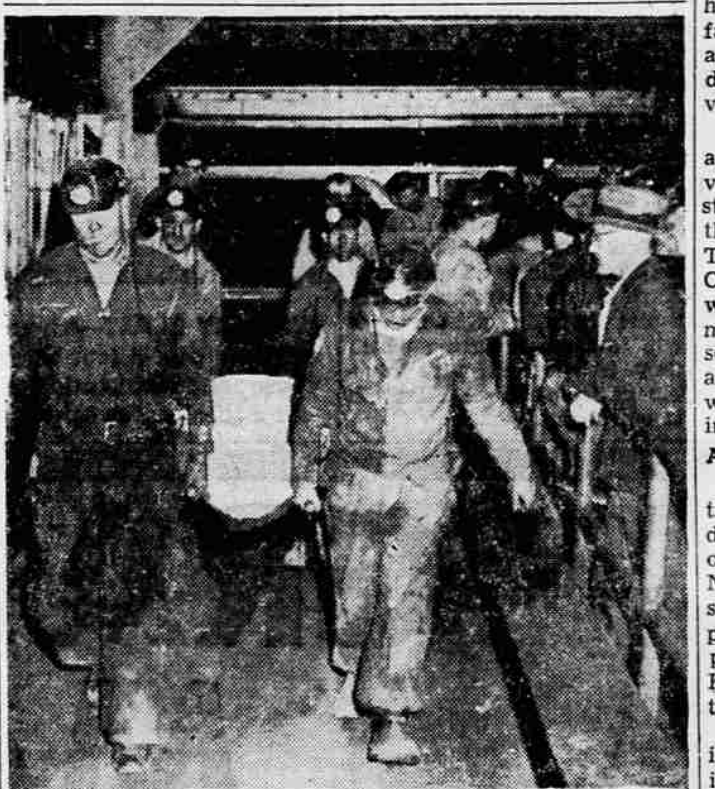
NEW MINE DISASTER —Rescuers carry body from coal mine at Bishop, Va., after an explosion in the mine trapped 22 miners. All the trapped miners perished.