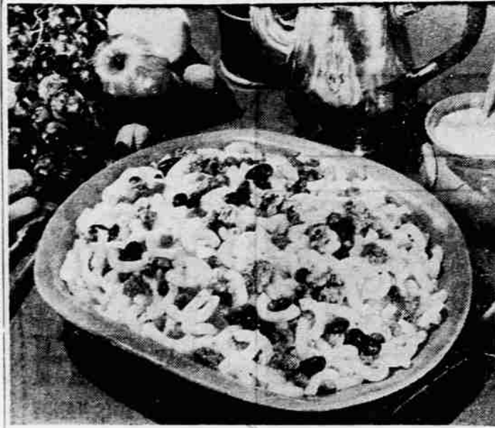
MEXICALI MACARONI - A buffet dinner featuring this mouth-watering Mexicali Macaroni is an inexpensive yet fun way of entertaining. It also serves as a reminder of the almost magical ability of macaroni products to provide gourmet dishes at low cost.

2 cups grated apple (about 6 apples) 2 tablespoons lemon juice 1 tablespoon grated lemon rind 1/4 cup honey 1 egg, slightly beaten 1/2 teaspoon salt 1 teaspoon cinnamon 1/4 teaspoon nutmeg 2 tablespoons flour