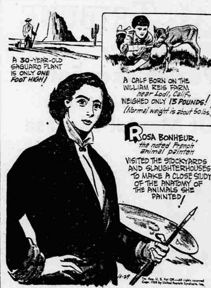
ROSA BONHEUR, the noted French animal painter, visited the stockyards and slaughterhouses to make a close study of the animals she painted.