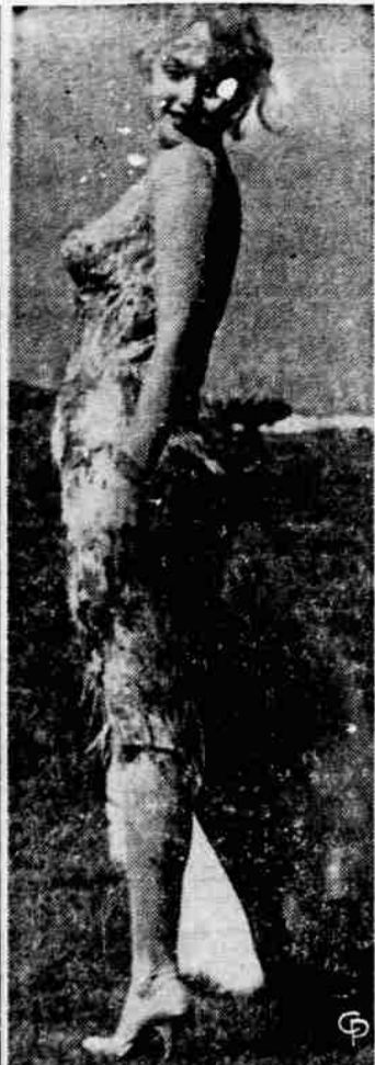
CARRYING few extra pounds, Marilyn Monroe casts backward glance at photographer while working on new film at San Diego.

HENNINGSON HOSPITALIZED Kansas City, Mo. —UPI—Sen. Thomas C. Hennings Jr. (D-Mo.), today faced the prospect of indefinite hospitalization for bronchial pneumonia. Hennings, who is not up for reelection this year, was admitted to a hospital Monday.