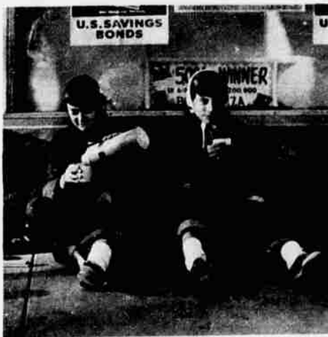
There's nothing like a coffee break to aid in the pursuit of the artistic life.