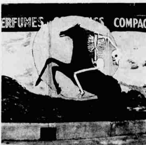
Old legends and myths spark the lively imagination of the artistic students.