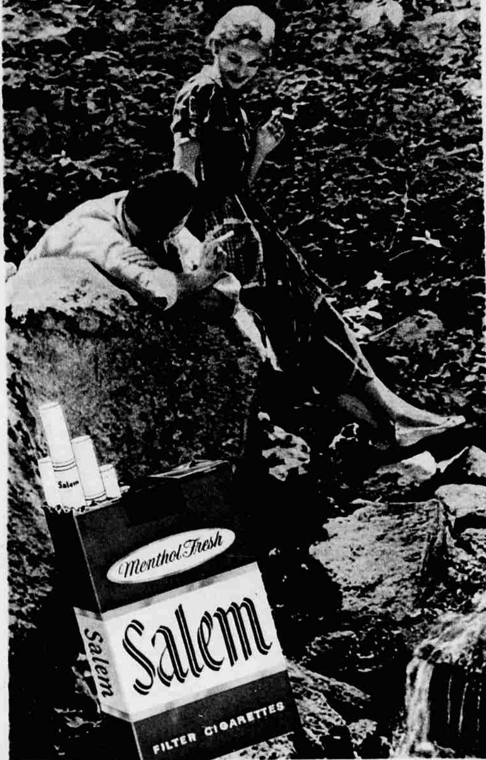
Created by R. J. Reynolds Tobacco Company