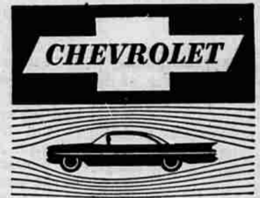
what America wants, America gets in a Chevy!

The more you look, the more you see that's new. Like the new Magic-Mirror finish that needs no waxing or polishing for up to three years. And you'll find important engineering developments—a new Hi-Thrift 6 that delivers up to 10% more gas economy with more usable horsepower at normal driving speeds; a wide choice of vigorous V8's; bigger, safer stopping brakes; a smoother, steadier ride. And you still get all those famous Chevrolet virtues of economy and dependability at your Chevrolet dealer's now!