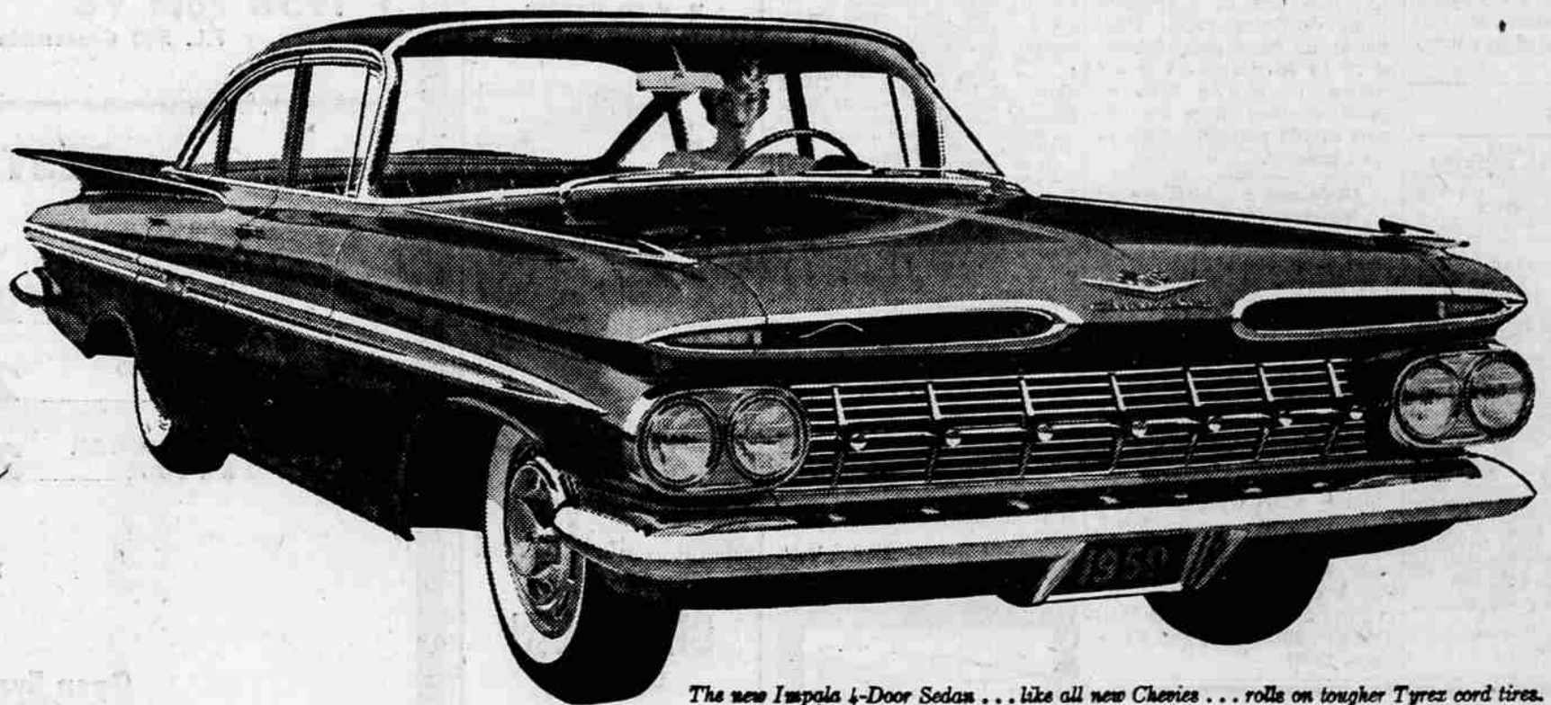
The new Impala 4-Door Sedan... like all new Chevies... rolls on tougher Tynex cord tires.

see your local authorized Chevrolet dealer