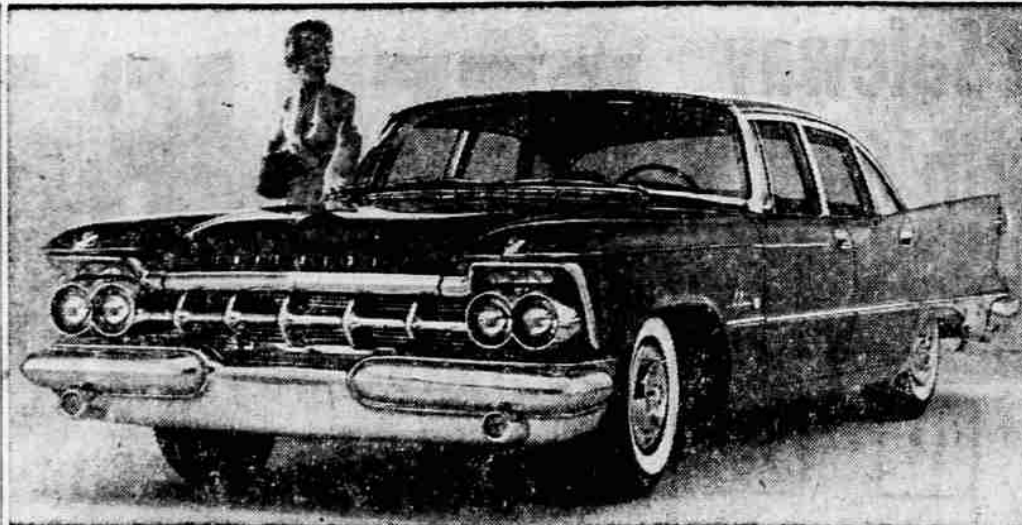
NEW IMPERIAL —The 1959 Imperial sedan, shown above, is one of four body styles in the new Imperial line. A new 350-horsepower engine, increased interior room for passengers and many optional features including front swivel seats are featured. The Imperial will go on display at Hamlin Motor company, Eighth and Front sts., Medford, Friday.

Zigzag, Ore.—(UPI)—Mrs. Cornelius DeYoung, 69, Portland, object of an all-night search in rugged country near Mt. Hood, has been found alive and in apparent good condition.