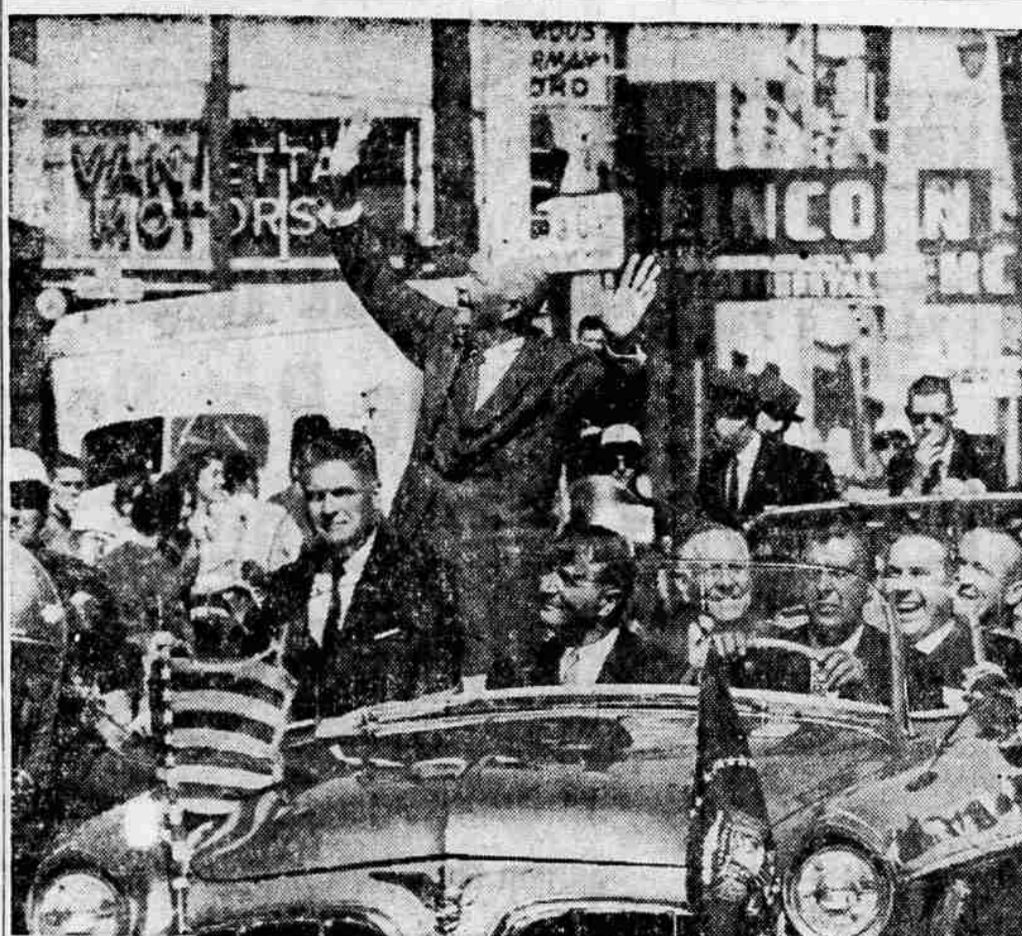
IKE ARRIVES IN SAN FRANCISCO —President Eisenhower waves with both hands as motorcade proceeds along Van Ness ave. in San Francisco. The President is campaigning on the West Coast to aid Republican candidates in the fall election.