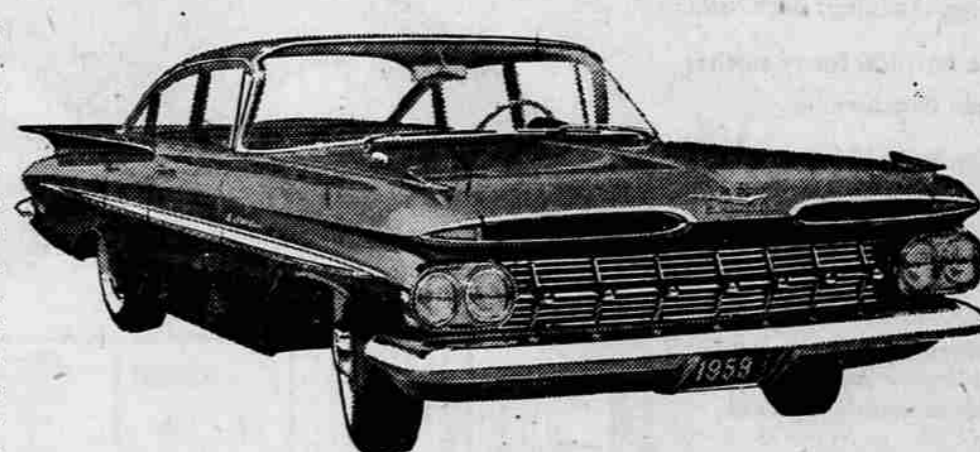
The Bel Air 4-Door Sedan shows Chevy's new Slimline design.

There's still more! A new finish that keeps its shine without waxing or polishing for up to three years. New Impala models. New wagons—including one with a rear-facing rear seat. And, with all that's new, you'll find those fine Chevrolet virtues of economy and practicality. Stop in now and see the '59 Chevrolet.