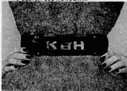
2. WIDE BELT WITH MONOGRAM