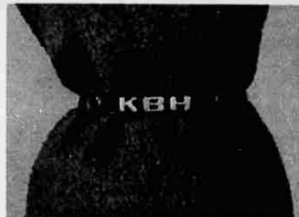
4. NARROW BELT WITH MONOGRAM