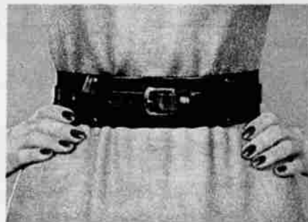
3. NARROW BELT ON WIDE BELT