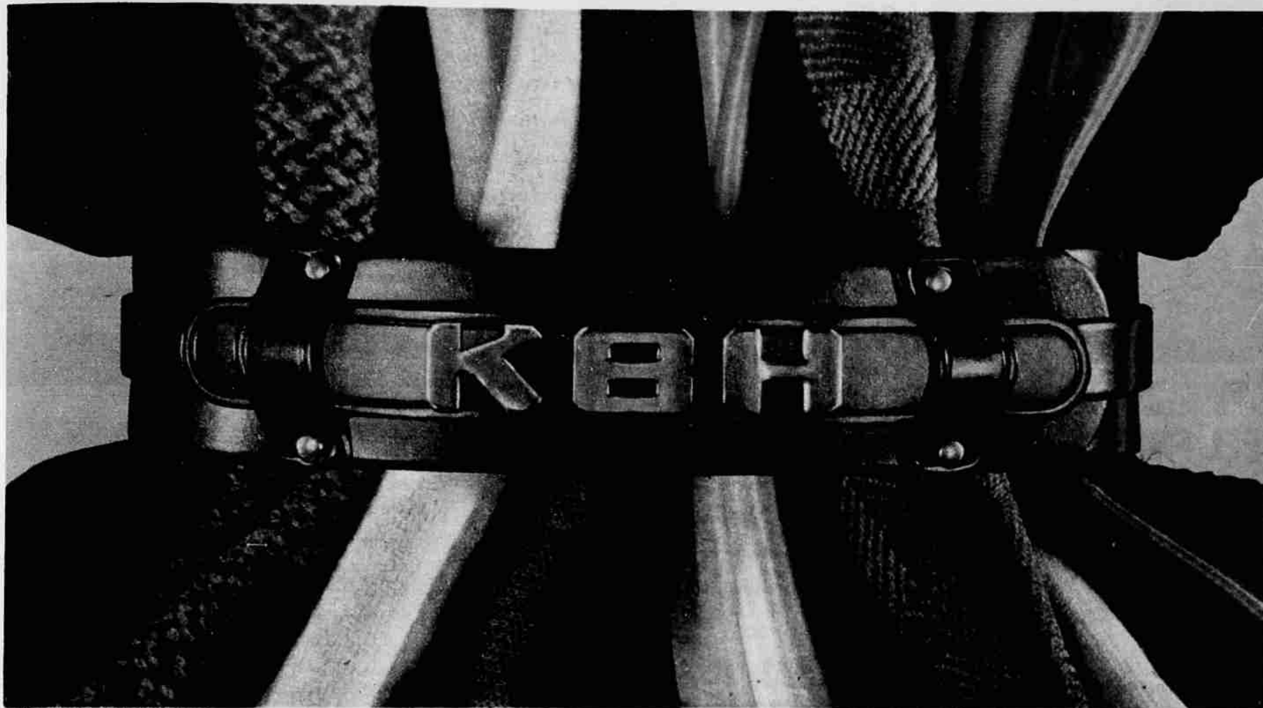
1. TWO BELTS, PLUS MONOGRAM