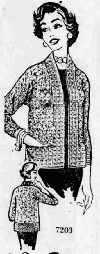
7203 by Alice Brooks

Smart topping to wear the year 'round. Crocheted in a jiffy—a smart accessory.