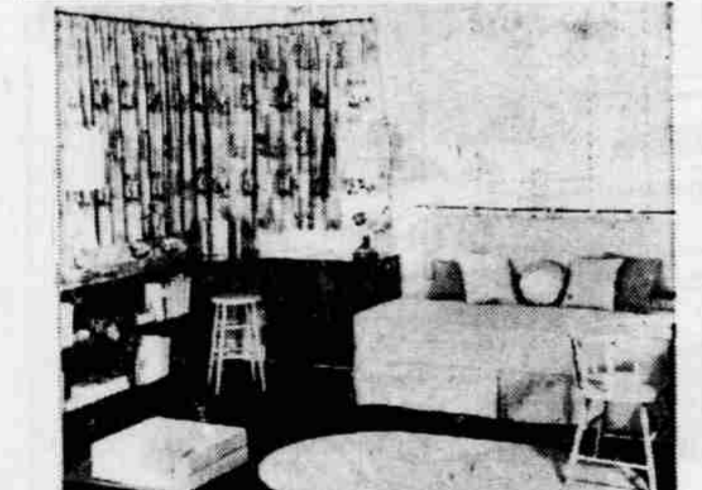
AT HOME—Here's a room that says, "Make yourself comfortable." The color scheme is set by the apron length draperies in a cotton Americana toile by Waverly. The cotton slipcover on the studio couch takes its cue from the taupe gray background of the drapery fabric while toss pillows pick up the brilliant lemon accents.