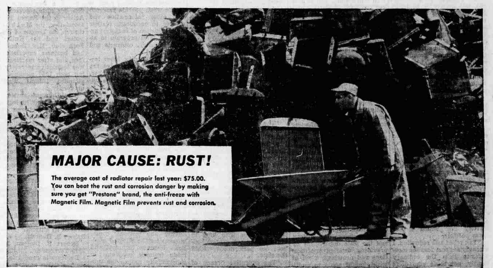
* OFFICIAL AAA FIGURES