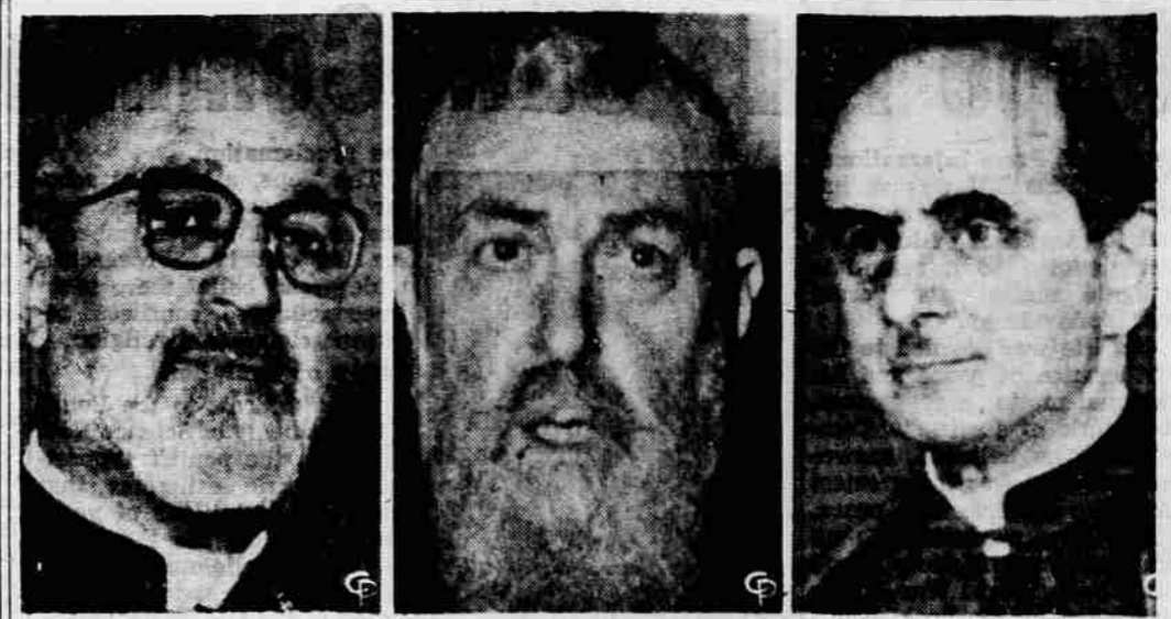
HOLDING HIGH PLACES in speculation concerning successor to Pope Pius XII, who suffered cerebral stroke, are these Roman Catholic Church leaders, according to Vatican reports. From left: Gregoire Pierre Cardinal Agagianian, 63, of Armenia; Eugene Cardinal Tisserant, 74, of France, and Archbishop Giovanni Battista Montini, 59, of Milan.

BIRTHDAY SURPRISE WASHABLE - QUILT LINED DRIVING COATS Girls' Sizes 3-6x—$4.88 Women's Sizes 12 to 18—$6.88 Deluxe cotton poplin coats with convertible hood, rich quilted linings... your favorite toggle buttons and completely washable! All top quality... all we've cut is the price! Women's: black, beige, red. Girls: tan, red or blue. Penney's Thrifty Sports Shop Second Floor 5 88 Age 7 to 14