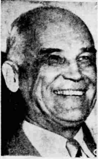
RETIRING from Supreme Court, Justice Harold H. Burton says poor health is responsible. He was appointed by President Harry S. Truman in 1944.