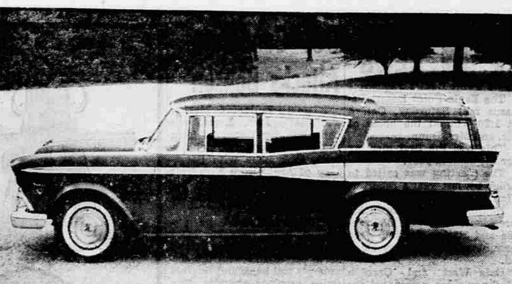
NEW RAMBLER—The 1959 Rambler models go on sale tomorrow at Lea Motors, Bartlett and Fifth sts., Medford. The new Ramblers feature exterior and interior styling and engineering changes designed to further increase economy of operation and durability. Eleven models, including station wagons, hardtops and sedans, will be offered in the six and V-8 series.

Portland Livestock—Cattle 300. Standard steers 23.50-24.50; choice 300 lb. heifers 26.50; good heifers 24.50-25.50; utility cows 18-20; canner-cutter cows 14.50-16; Holstein cutters to 17.50; light canners 12-14; utility bulls 23-24. Calves 75. Choice vealers 30-33; individual 34; good vealers 27-29; good-choice slaughter calves 26-30; cull-utility 15-21. Hogs 300, U.S. 1 and 2 butchers 21.50-22; mixed grades 21-21.50; one and two grade sows 20-35 lb. 19-20; mixed grade 350-350 lb. 17-19. Sheep 600. Choice slaughter lambs 20.50-20.75; good 19-20; good-choice feeders 17-19; cull-good slaughter ewes 3-7.50.