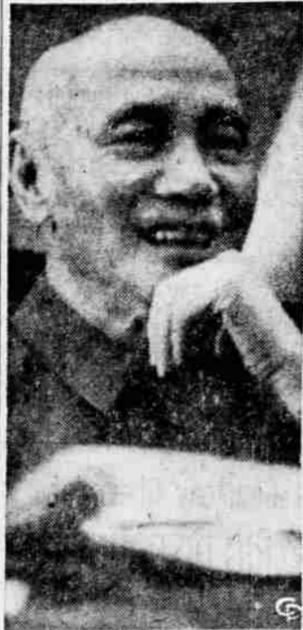
GRANTING his first press conference in three and one-half years Generalissimo Chiang Kai-shek told 100 newsmen he reserved the right to bomb Red mainland when and if "crucial moment arrives." Chiang is 71.

France is launching its fifth republic and something had to be done.